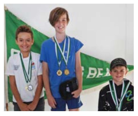
UNDER 10 BOYS CHAMPIONS