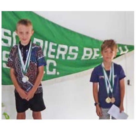
UNDER 8 BOYS CHAMPIONS