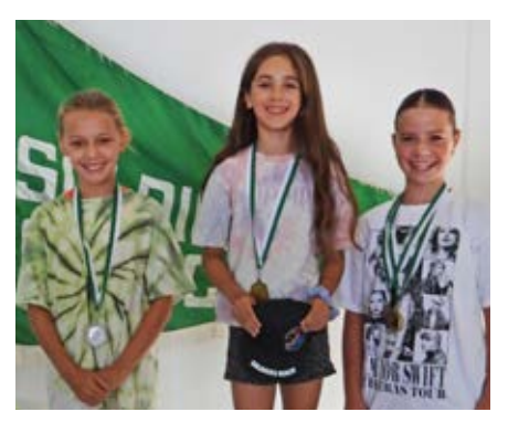
UNDER 11 GIRLS CHAMPIONS