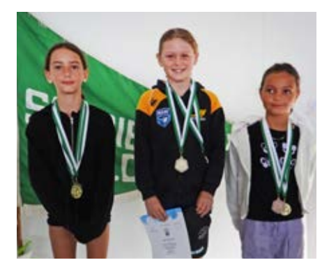
UNDER 9 GIRLS CHAMPIONS