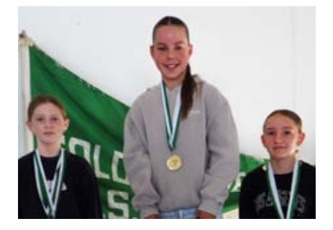
UNDER 12 GIRLS CHAMPIONS