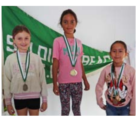
UNDER 8 GIRLS CHAMPIONS