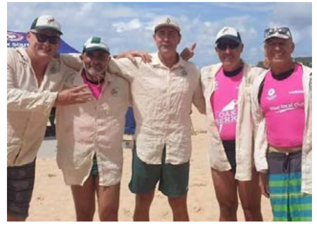
Masters Competitor OTY 9 Volters Boat Crew