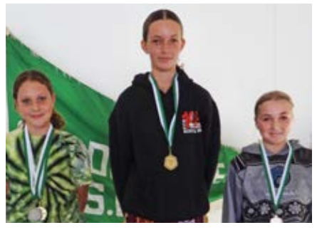
UNDER 13 GIRLS CHAMPIONS