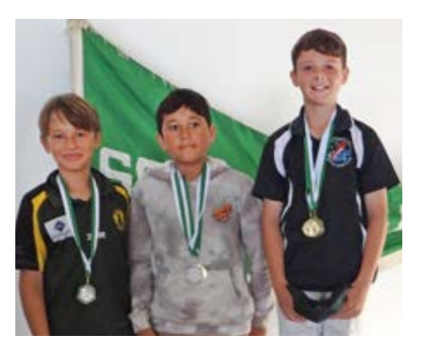
UNDER 11 BOYS CHAMPIONS